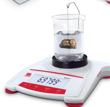
Scout shown with optional Density Determination Kit

It's all about accuracy and efficiency with the OHAUS Scout balance. Stabilization time as fast as 1 second combined with high resolution deliver extremely precise and repeatable weighing results that you can count on time and time again. This makes the Scout ideal for routine experiments and other weighing applications in your classroom.