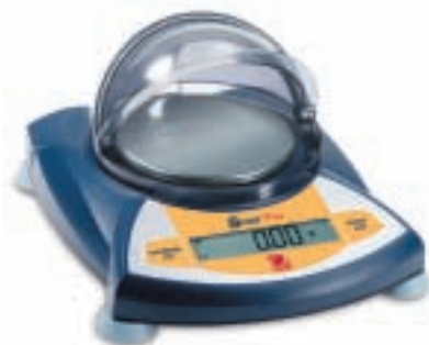
Milligram Model with Round Platform (draftshield included)