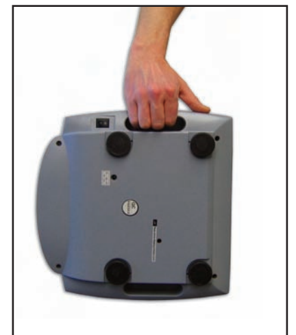
Integrated handles in the housing allow easy transportation of the EC Scale